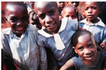
Ugandan children love having their picture taken.

Make 1 dollar a day. Seven children per family. 40—45 year life expectancy. Those are some of the statistics you learn when you talk to a Ugandan. Living here in America, it seems like a very sad and desperate life. However, when you worship with a Ugandan you see a life and spirit that you very rarely see in churches in the United States. The Ugandans are one of the most loving and gentle people I have ever interacted with. They always smile and will always welcome you into their home (or hut).