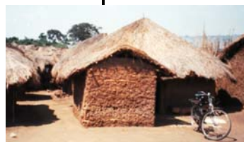
A typical Ugandan hut.

It is true that they have many problems. Poverty, AIDS, sickness, orphans, rebel fighting, struggling economy, hunger and lack of education are all issues they struggle with. However, once you get beyond these you see a people with a different perspective on life. Relationships, family, life after death, spiritual issues and their place with God are all very real care bouts in their daily life. Their struggles are a blessing in that they never get too busy, too caught up with work, too focused on getting more or too concerned about their status with others to ignore the most important things in life.